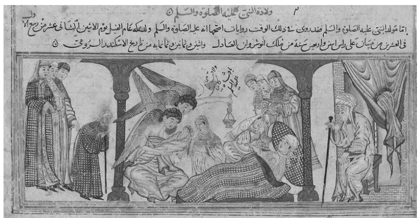
Fig. 2. The birth of the Prophet Muhammad in a thirteenth-century Iranian “compendium of chronicles.”

has become filled with the breath-soul-of-life.” The allusion here, as in the just-cited condemnatory hadith, is to the Koran: “O Jesus, son of Mary. . .you did make out of clay, the figure of a bird, by My leave, and you did breathe into it, and it becomes a bird, by My leave” (5:110). Notice how the same verse of the Koran—whose bird story, by the way, is borrowed from the Christian Infancy Gospel of Thomas—can be used to praise the making of art in Islam, or to prohibit it. And although today’s ayatollahs might insist that only the latter use is Islamic, tens of thousands of lavishly illustrated Persian manuscripts suggest that their ancestors were just as open to the former. (For a digitized sample of fifty of these manuscripts from the British Library’s holding of roughly eleven thousand, see http://www.bl.uk/projects/digital-access-to-persian-manuscripts .)