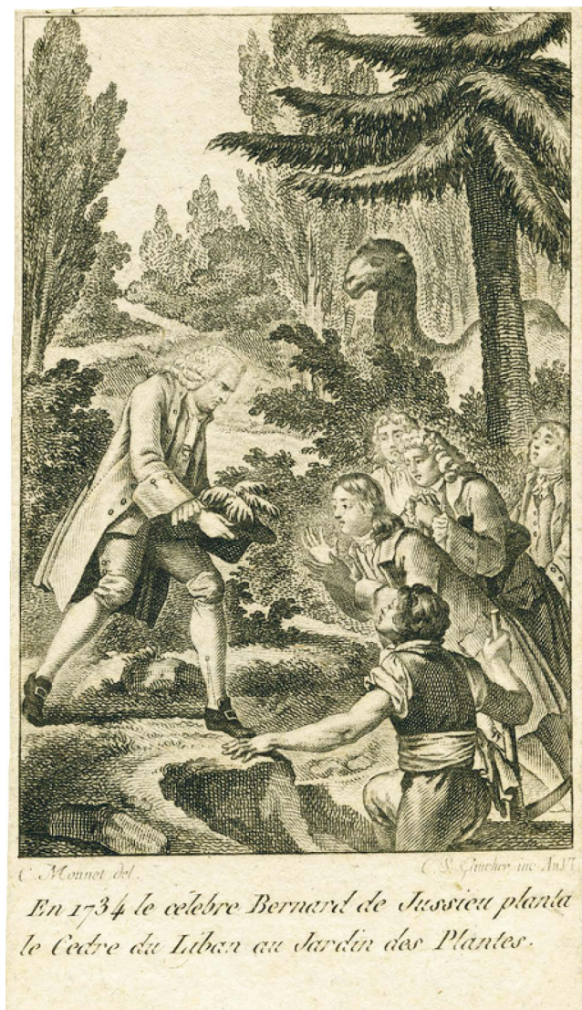
Fig. 6. Bernard de Jussieu plants the Cedar of Lebanon. Drawing by Charles Monnet, engraving by Charles-Étienne Gaucher, 1798.