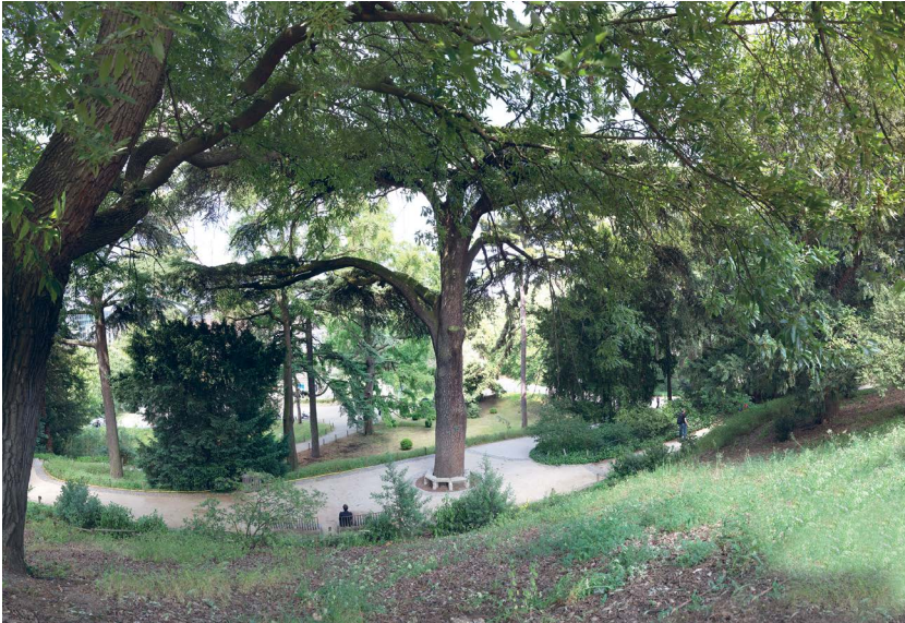
Fig. 4. Cedrus libani (9 June 2015).

In addition to co-opting Vaillant's herbarium, Jussieu also appropriated the now-vacant position of underdemonstrator of plants, which he gave to his younger brother Bernard. It was thanks to Bernard de Jussieu that the Jardin came to house the most famous of its Remarkable Trees: the majestic cedar of Lebanon ( Cedrus libani ) that presides over the entrance to the twisting, climbing path called the Labyrinth (figs. 4 and 5). Just how Bernard de Jussieu came to plant the cedar in the Jardin has been a matter of imaginative speculation. Versions of the story proliferate, and, curiously, all of them involve a hat. According to the Christian version, Bernard carried the tiny seedling all the way from the Holy Land, cradled lovingly in his hat, depriving himself of water to keep the baby tree moist. A more