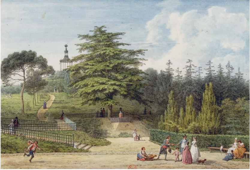
Fig. 5. Jean-Baptiste Hilair, The cedar in the Jardin du Roi , 1794.