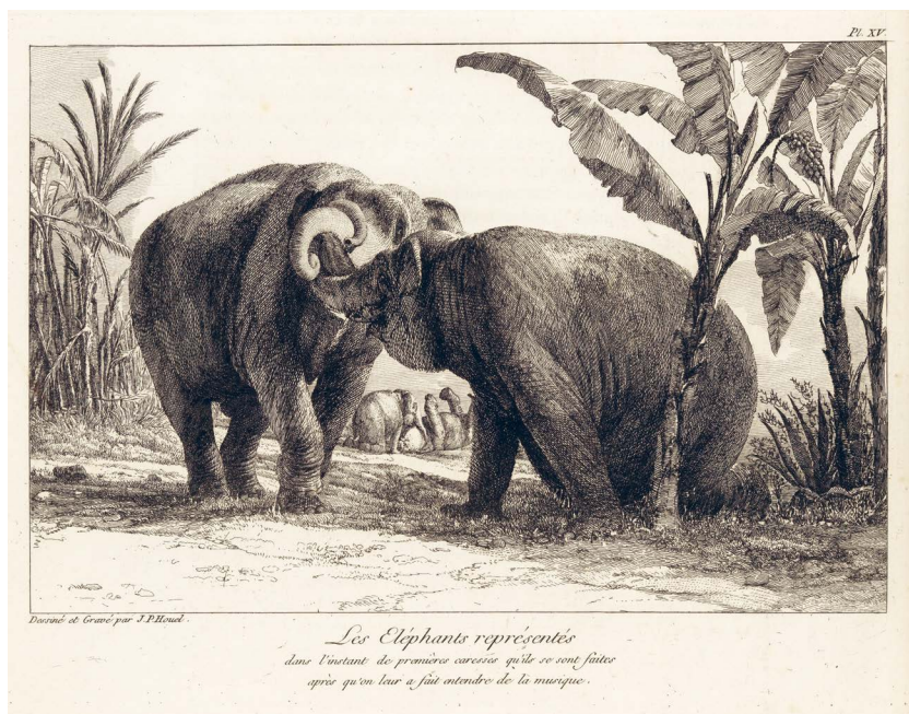
Fig. 7. “The Elephants represented in the instant of the first caresses they gave one another after we had them listen to the music.” Jean-Pierre Houel, Histoire naturelle des deux éléphants, male et femelle, du Muséum de Paris, venus de Hollande en France en L'an VI , 1803.

the air resound with cries of joy. Their eyes . . . were wet with tears. It was the most touching scene.”