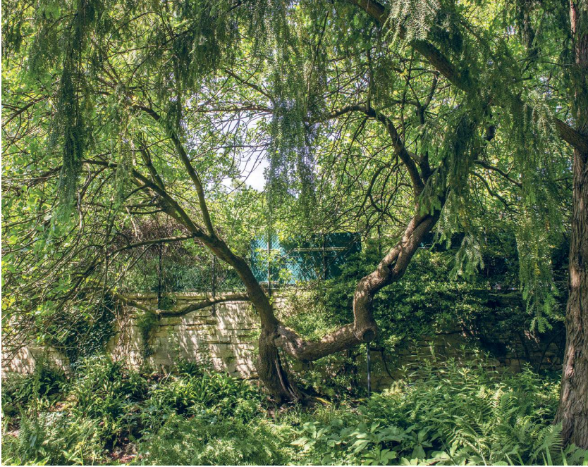
Fig. 2. Pistacia vera L. (9 June 2015).