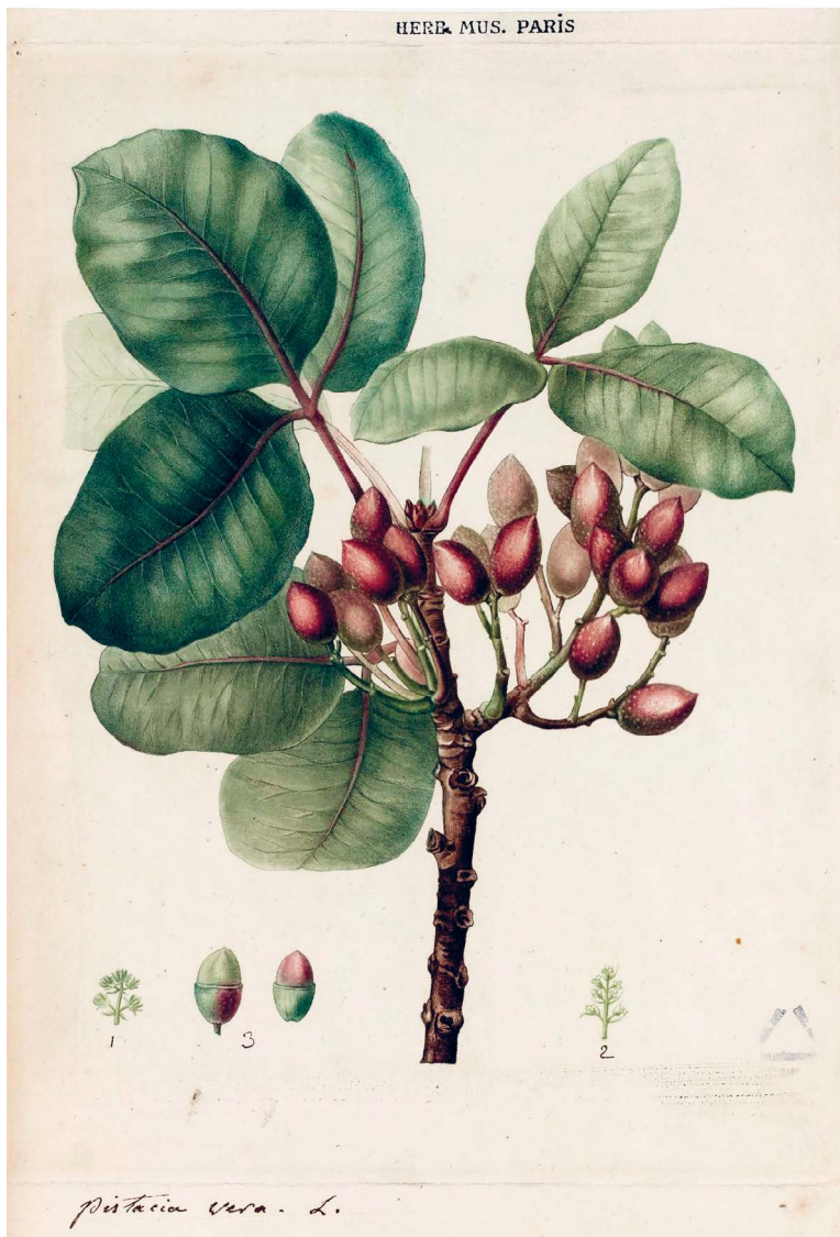
Fig. 3. Pierre-Joseph Redouté, Pistacia vera , ca. 1801–1819. From the Moquin-Tandon herbarium, courtesy of Muséum national d'Histoire naturelle. Special thanks to Mme Liliane Rayer for identifying this colored lithograph, which the artist probably executed from specimens from Vaillant's pistachio in the Jardin des plantes.